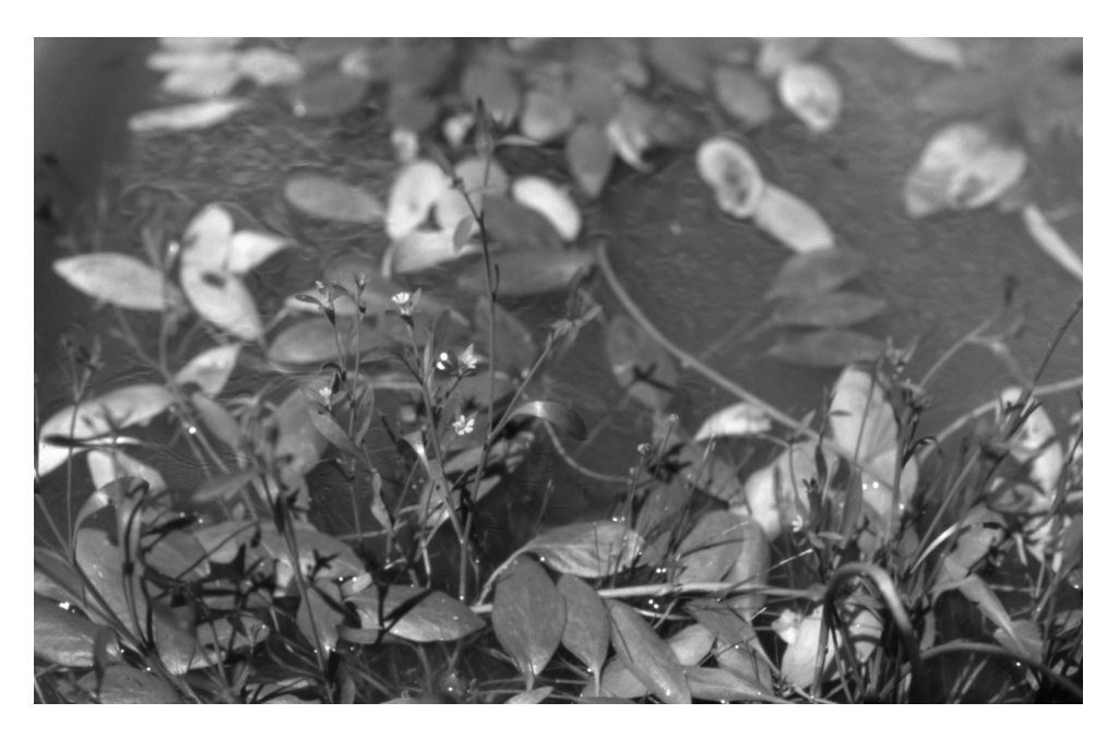
Fig. 4. Goodenia nocoleche B. Pellow & J.L. Porter in cultivation.

Ecology: Goodenia nocoleche can germinate and grow in standing water up to 0.6 m deep, with floating leaves on greatly extended petioles (Fig. 4), similar in appearance to Potomogeton octandrus. As water recedes inflorescences emerge and grow rapidly. The plants die back rapidly as sediments dry completely. Goodenia nocoleche has been observed growing in Pied Stilt Swamp during several flood events (December 1998, 2000) and appears to be a summer annual needing inundation in shallow temporary freshwater wetlands to stimulate a germination response from the persistent seed bank, followed by partial drying to initiate flowering. These observations are supported by the behaviour of the species in cultivation. Ability to initiate vegetative growth and