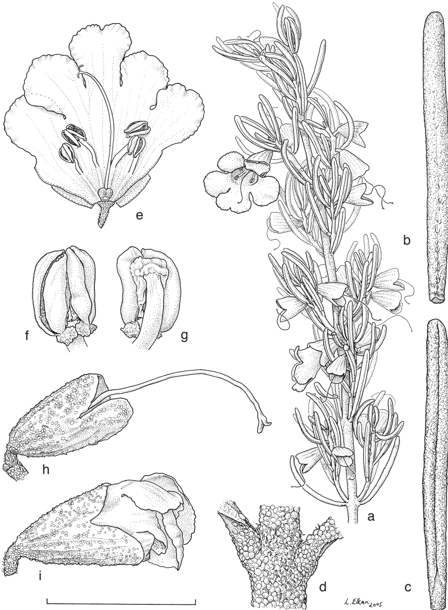
Fig. 2. Prostanthera teretifolia Maiden & Betche a , branchlet; b , leaf showing adaxial surface; c , leaf showing abaxial surface; d , detail of nodal area of branchlet and base of leaves; e , open flower showing corolla, stamens and gynoecium; f , stamen, showing ventral surface of anthers, locular appendages and minute connective appendage (visible between locules of anther); g , stamen showing dorsal surface of anthers, locular appendages and connective; h , fruiting calyx and persistent style and stigma (lateral view); i , flower bud (lateral view) (from Cambage s.n. , 29 Sep 1907, NSW 134430). Scale bar: a=20 mm, b, c, h & i=6 mm, d, f & g=2.4 mm, e=10 mm. Illustration by Lesley Elkan.