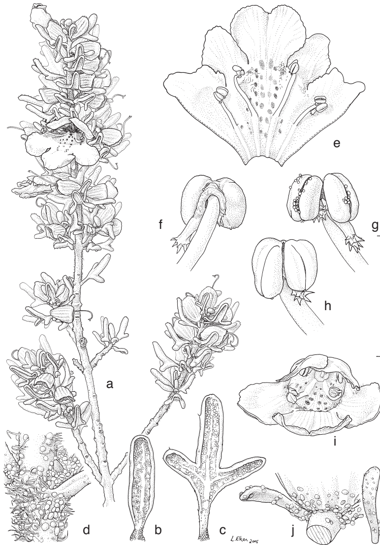
Fig. 1. Prostanthera staurophylla F. Muell. a , branchlet; b , entire leaf (abaxial surface); c , 3-lobed leaf (abaxial surface); d , detail of nodal area of branchlet and base of leaves; e , open flower showing corolla and stamens; f , adaxial (upper) stamen, showing dorsal surface of anther, connective and appendage; g , adaxial stamen showing ventral surface of anther, and connective appendage extending from behind; h , abaxial (lower) stamen showing dorsal surface of anther, connective and appendage; i , flower showing dots on corolla tube and stamens (ventral view); j , base of calyx, showing prophylls, with one prophyll detached (from J.T. Hunter s.n. , 1 Nov 2004, NSW). Scale bar: a=20 mm, b & c=6 mm, d, f, g, h & j=2.4 mm, e & i=10 mm. Illustration by Lesley Elkan.