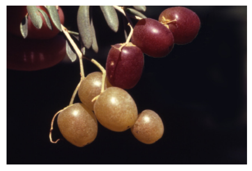
Fig. 4. Nitraria billarderi fruit (both the dark and the light fruits are ripe).