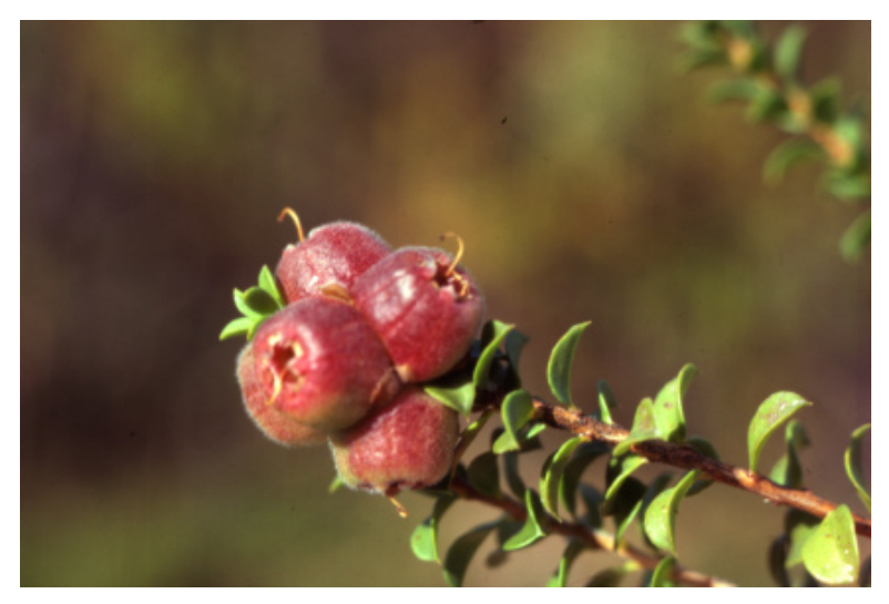
Fig. 3. Kunzea pomifera fruits