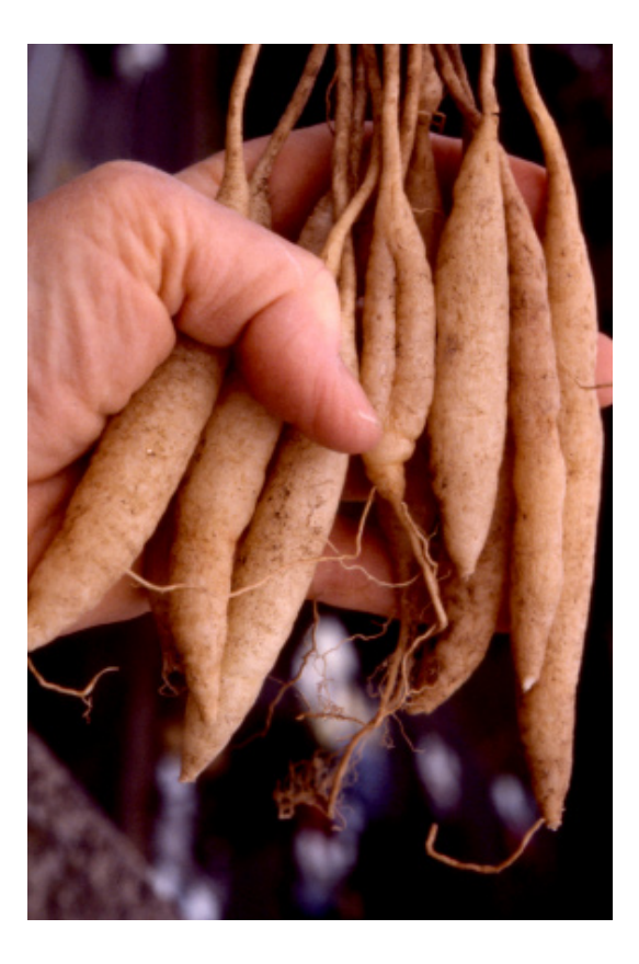
Fig. 2. Tubers of Arthropodium sp. A (Conran et al. 1993)/sp. 1 (Conran 1994).