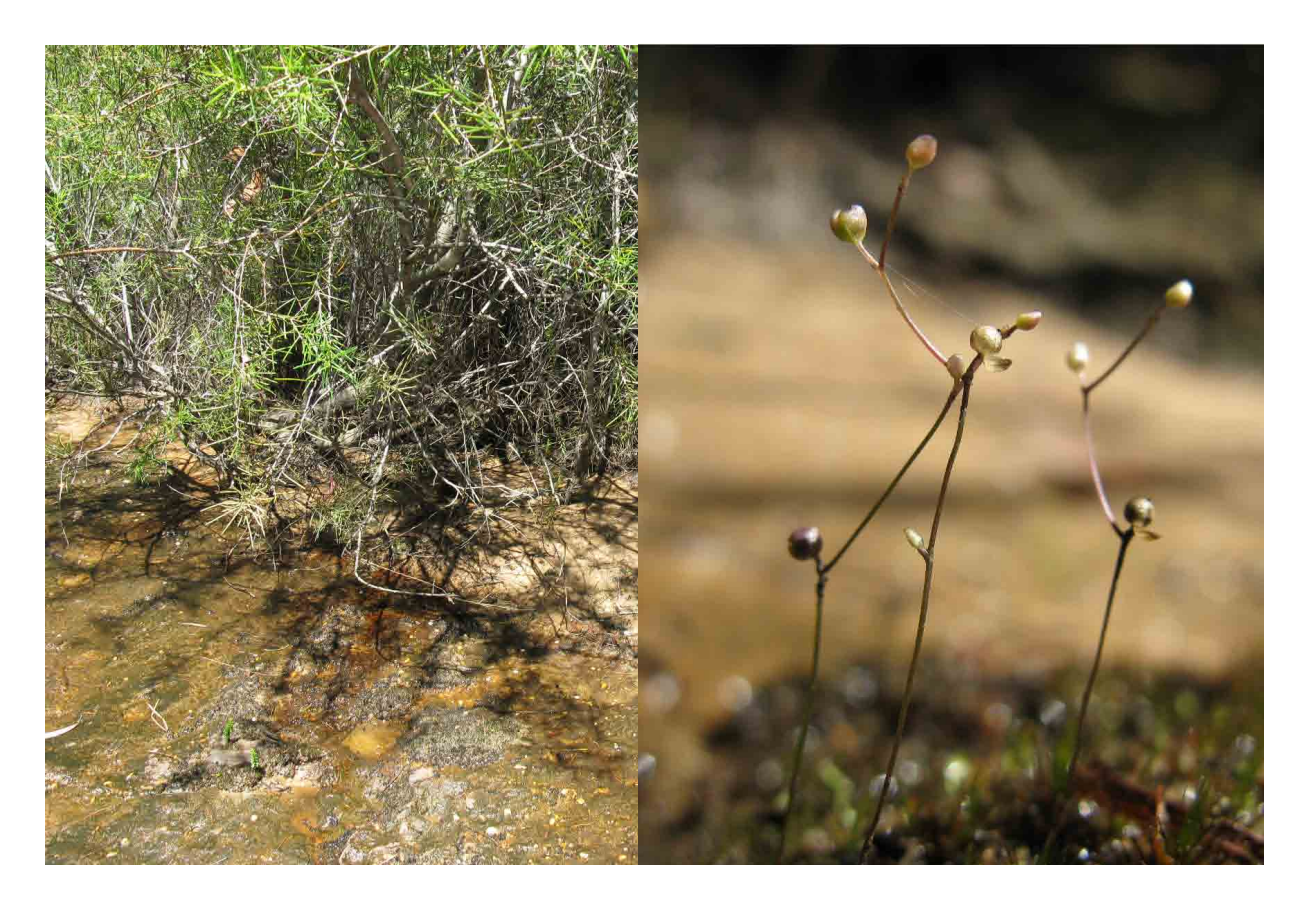
Fig. 2. Utricularia subulata. a, riparian habitat, Royal National Park, Sydney (Central Coast); b, 'zig-zag' habit of inflorescences (cleistogamous flowers).

Distribution: Pantropical: Australia, native to Queensland and Northern Territory; introduced in New South Wales, Central Coast, Royal National Park ( Ciric 4 ; Jobson 1355 , 1409 ), and South Coast, Morton National Park, Porters Creek Dam, c.16 km W of Yatte Yattah ( Jobson 1359 ). The extent of the distribution and habitat preferences of this species are inadequately known, largely because only 19 other naturally occurring specimens are known from herbarium collections.