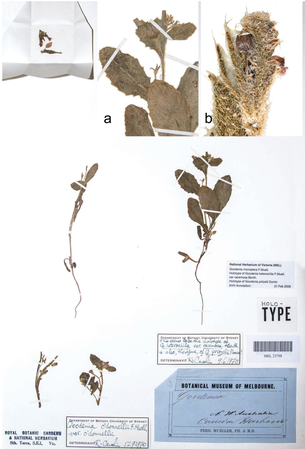
Fig. 1. Goodenia pritzelii . Holotype [J. Martin] (MEL). Inset a. leaves and inflorescence; Inset b. flower.