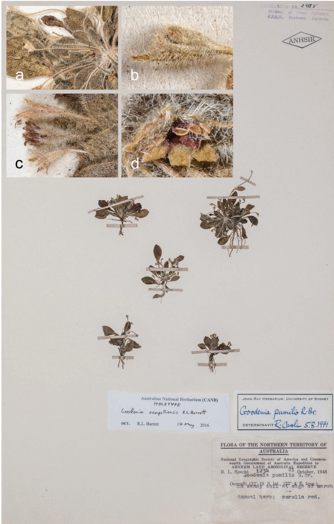
Fig. 3. Goodenia oenpelliensis . R.L.Specht 1234 (CANB). Inset a. leaves and inflorescence; Inset b. calyx; Inset c. inflorescence. Inset d. flower. Images by R.L. Barrett.