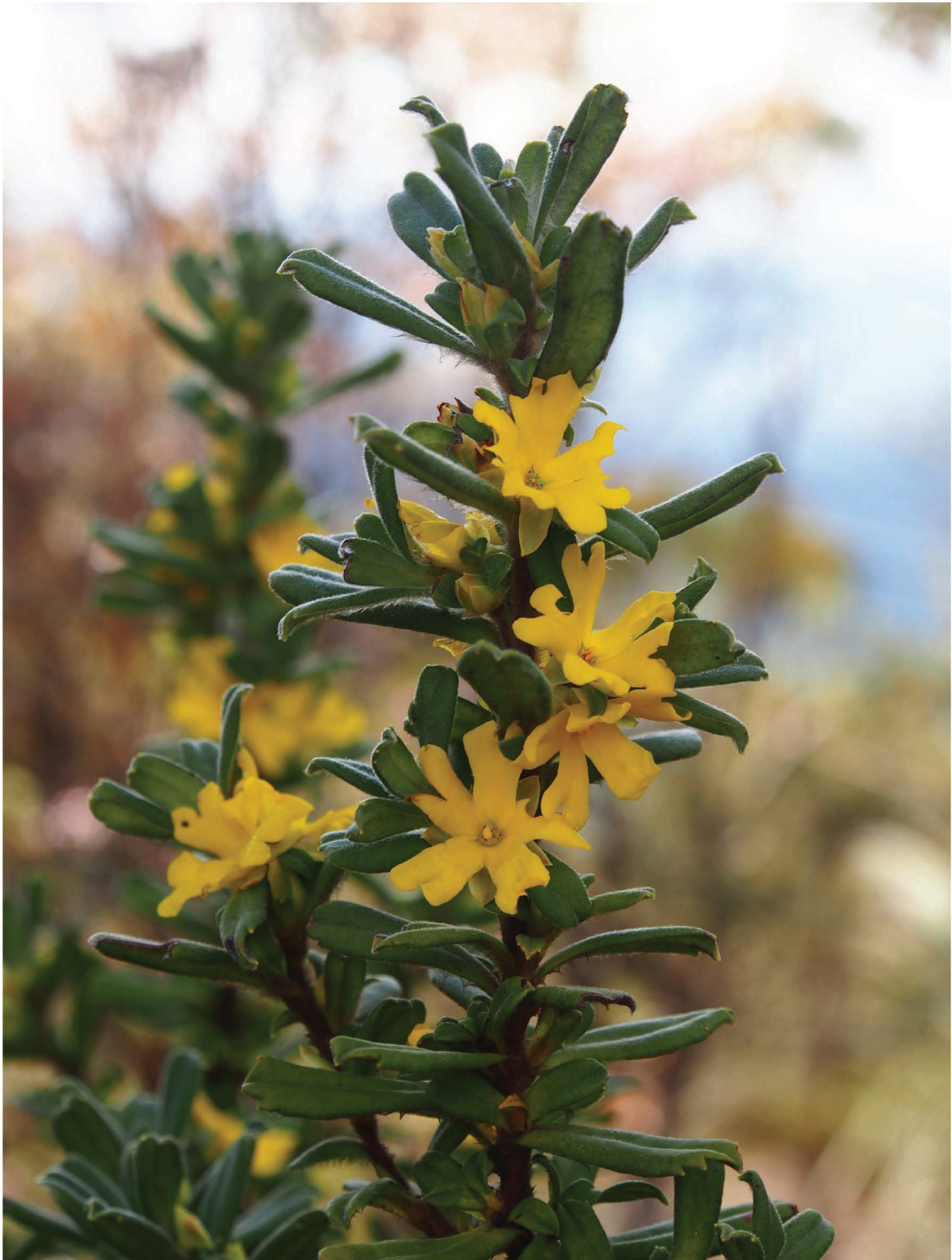
Fig. 1. Hibbertia circinata near the summit of Mt Imlay, south-eastern NSW. Note the villous hairs at the bases of new leaves and the irregular teeth at the apex of some leaves. Such non-entire leaves were seldom observed (unvouchered specimen).