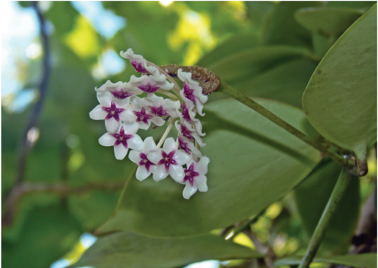
Fig. 1. Inflorescence of Hoya anulata (Photo: W.A. Mustaqim).