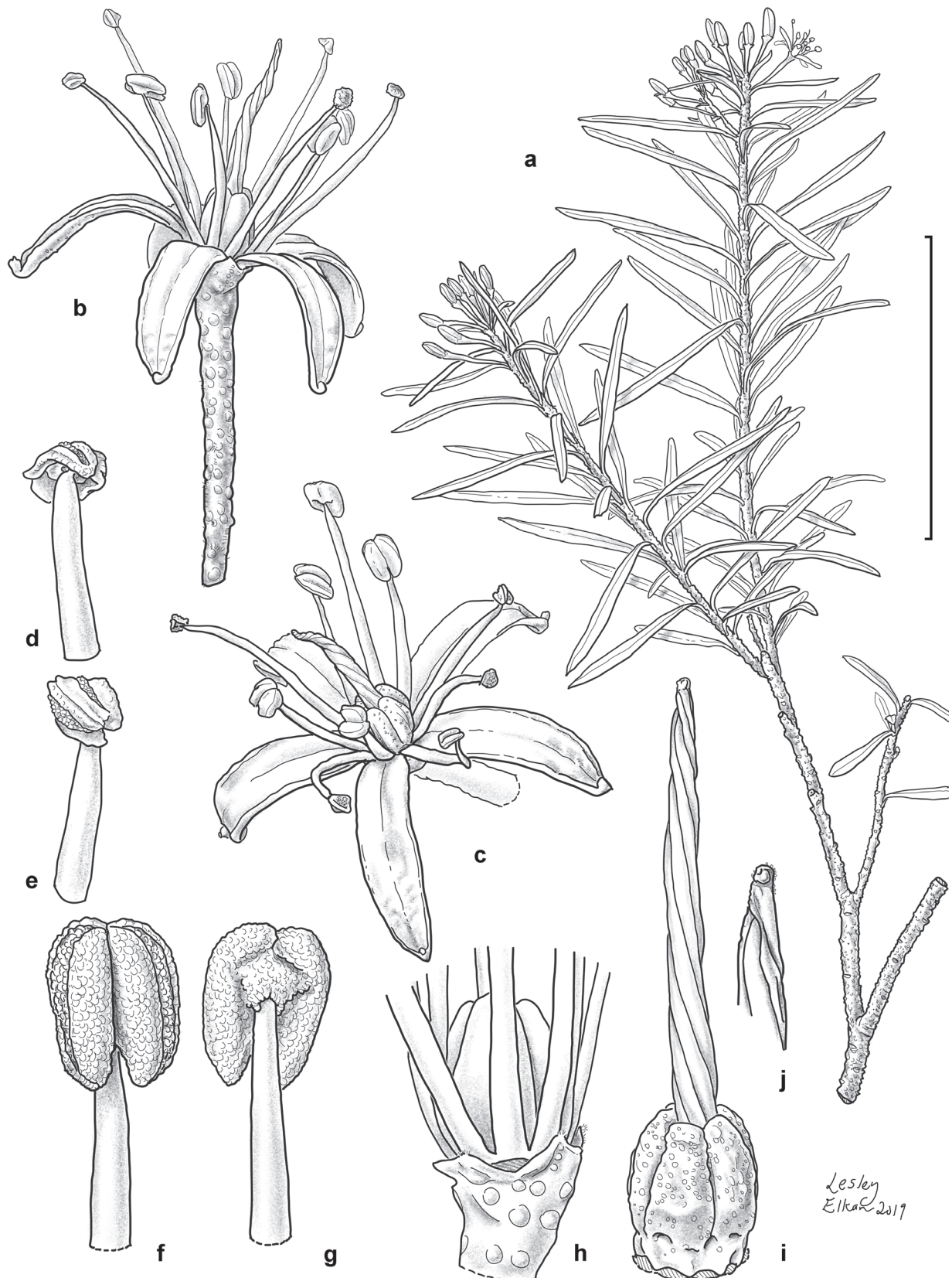
Fig. 1. Leionema praetermissum : a - habit; b - flower, side view; c - flower, ¾ view; d - antesepalous anther, abaxial view; e - antesepalous anther, adaxial view; f - antepetalous anther, adaxial view; g - antepetalous anther, abaxial view; h - calyx, base of stamens and gynoecium detail; i - gynoecium; j - stigma detail. a-j - Weston 2432 & Rodd (NSW). Scale bar = 50 mm for a; 7.5 mm for b & c; 2 mm for d - g & j; 3.3 mm for h & i. Illustration: L. Elkan.