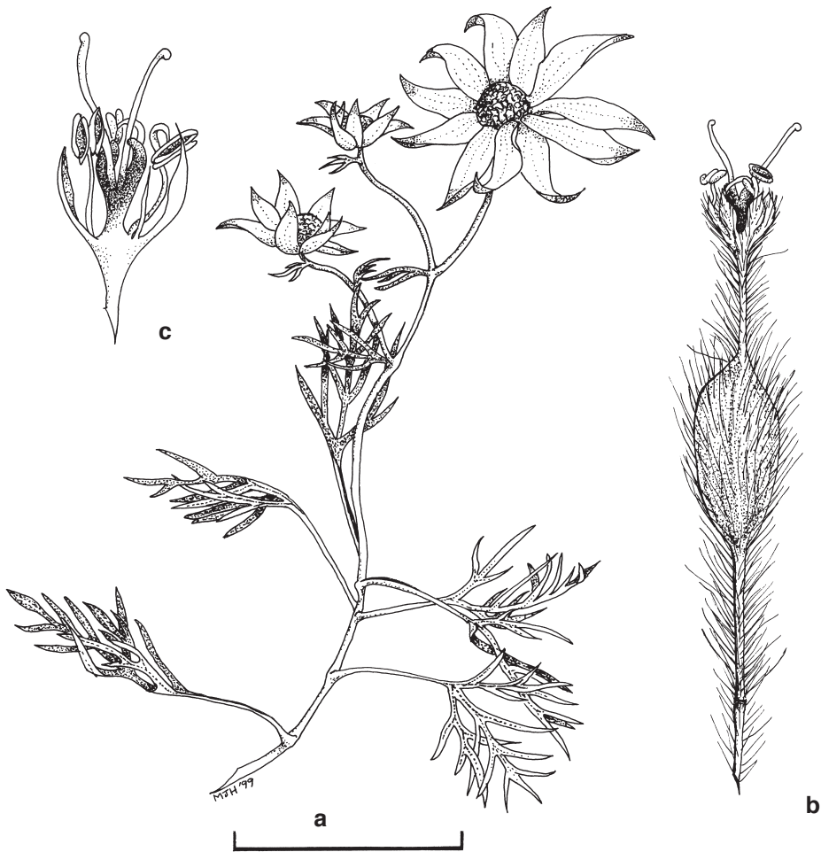
Fig. 1. Actinotus periculosus (from Henwood 511 ). a , foliose upper portion of branch with inflorescence; b , hermaphrodite flower; c , apex of gynoecial column with 3 sepals, 4 petals and 2 stamens removed (trichomes not illustrated). Scale bar: a = 100 mm; b = 5 mm; c = 4 mm.

Selected specimens: Queensland: Leichhardt: 'The Tombs', c. 143 km from Injune, Mt Moffatt section of Carnarvon National Park, Henwood 508 , 18 Oct 1998 (BRI, NSW, SYD); 15 km N of 'The Tombs' on Marlong creek, Mt Moffatt region of Carnarvon National Park, Henwood 511 , 19 Oct 1998 (BRI, NSW, SYD); Lookout at Lonesome National Park, Henwood 513 , 19 Oct 1998 (BRI, NSW, SYD); 'Balloon Cave', Carnarvon Gorge, Carnarvon National Park, Henwood 517 , 21 Oct 1998 (BRI, NSW, SYD); 'Spyglass Peak' Salvator Rosa section of Carnarvon National Park, Henwood 518 , 21 Oct 1998 (BRI, NSW, SYD); c. 100 m north of Get Down track, Robinson National Park, Henwood 520 , 23 Oct 1998 (BRI, NSW, SYD).