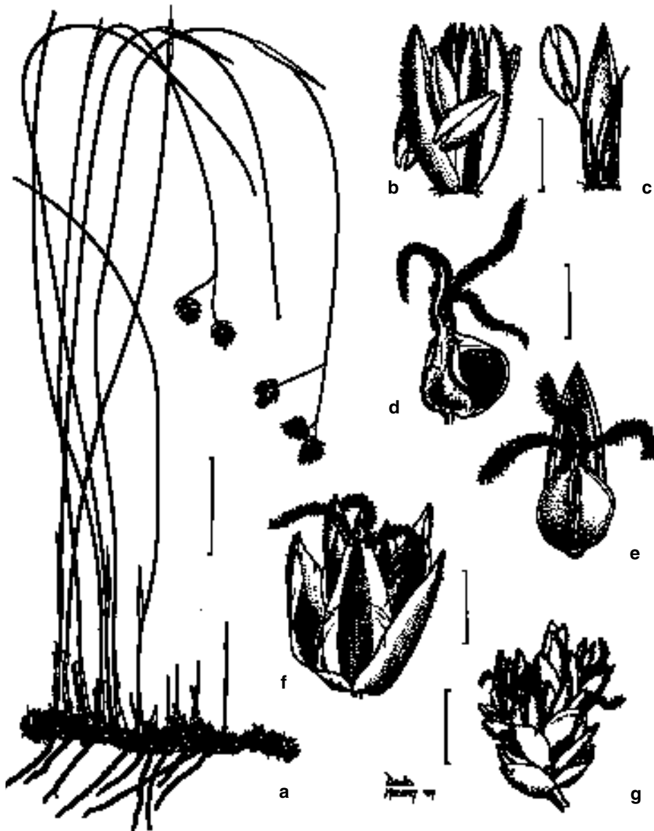
Fig. 2. Georgeantha hexandra . a , habit. b , male flower. c , dissected male flower. d , fruit with seed. e , f , female flower. g , spikelet. a – c , from Briggs 7461; d , Briggs 6395; e , Gittins 17 106; f , Haegi 1911. Scale bars: a = 5 cm, b – f = 3mm, g = 6 mm.