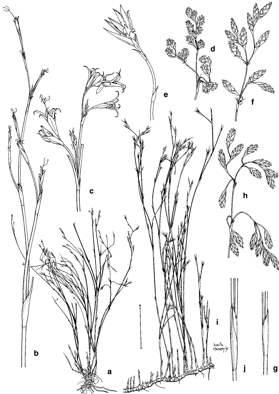
Fig. 2. a–d, H. caespitosa , a–c, female: a, habit (only a few of the many culms shown); b, inflorescence (Briggs 7590a); c, fruiting inflorescence (Briggs 6732); d, male inflorescence (Briggs 6731); e–g, H. viridis , e, female fruiting spikelet (Briggs 689), f, male: inflorescence, g, culm sheath (Briggs 869); h–j, H. exsulca , h, male inflorescence (Orchard 1394); i, plant habit with female inflorescences (Wilson 8106); j, culm sheath (Dec 1912, Koch). Scale bar: a, i = 5 cm; b–h, j = 1 cm.