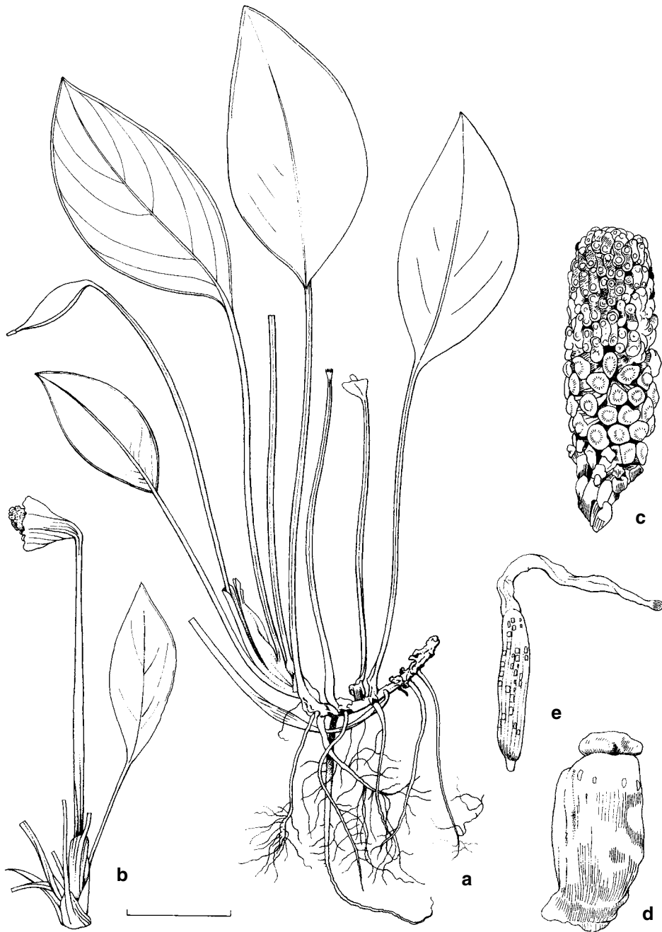
Fig. 4. Piptospatha manduensis A. Hay & Bogner. a, Habit; b, Inflorescence; c, Spadix; d, Berry; e, Seed. (Kostermans 13493a). Scale bar: a, b = 2 cm; c = 4 mm; d = 1.4 mm; e = 1 mm