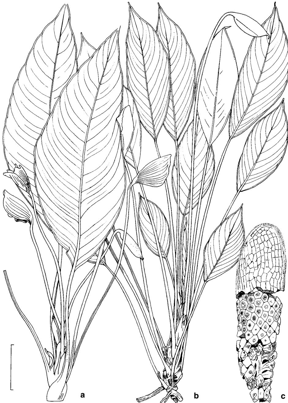
Fig. 6. Piptospatha grabowskii (Engl.) Engl. a, b, Habit, broader and narrower-leaved forms; c, Spadix. (a: Paie S 45112; b: Boyce 1434; c: Chai S 36010). Scale bar: a, b = 4 cm; c = 4 mm.