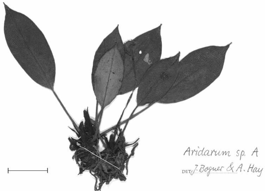
Fig. 3. Aridarum sp. A. Whole plant (Ilias & Azahari S 35676). Scale bar: = 3 cm.