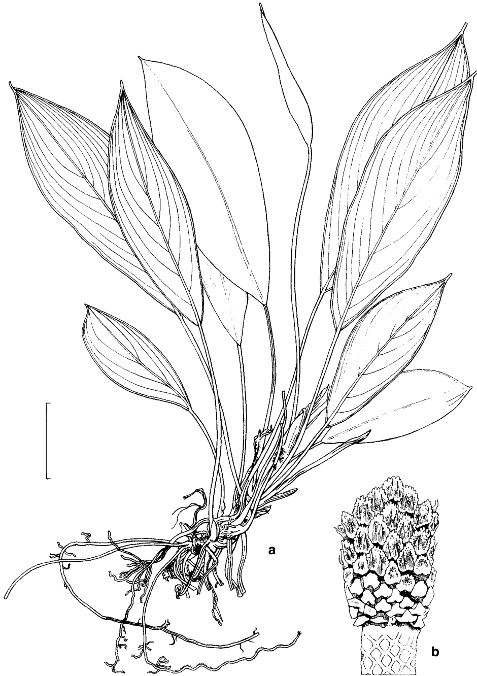
Fig. 1. Aridarum rostratum Bogner & A. Hay. a , Habit; b , Part of spadix showing top of female zone, interstice and base of male zone. (Winkler 1066). Scale bar: a = 3 cm; b = 4 mm.