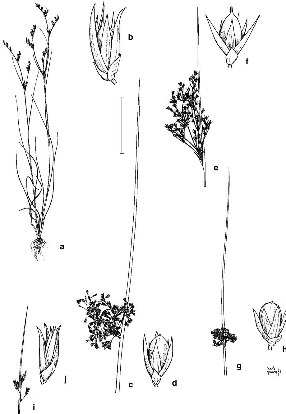
Fig. 2. Juncus bufonius : a , habit; b , flower (from M.D. Tindale (NSW 18459)). J. decipiens subsp. medianus : c , inflorescence; d , flower (from L.A.S. Johnson (NSW 75499)). J. inflexus : e , inflorescence; f , flower (from D.E. Albrecht 1594 (NSW)). J. durus : g , inflorescence; h , flower (from R.D. Hoogland 7595 and R. Schodde (NSW)). J. nupela : i , inflorescence; j , flower (from J.F. Veldkamp 6369 (NSW)). Scale bar = 6 cm (a), = 3.5 mm (b, d, f, h, j), = 4 cm (c, e, g, i).