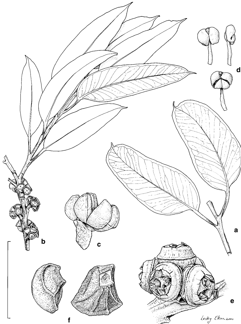
Fig. 1. E. boliviana . a , Juvenile leaves. b , adult leaves and inflorescences. c , inflorescence and buds. d , anther. e , inflorescence and fruit. f , seed. (from Williams 99187 & Clarke). Scale bar: a, b = 8 cm, c = 2 cm, d = 2.5 mm, e = 3 cm, f = 4 mm.