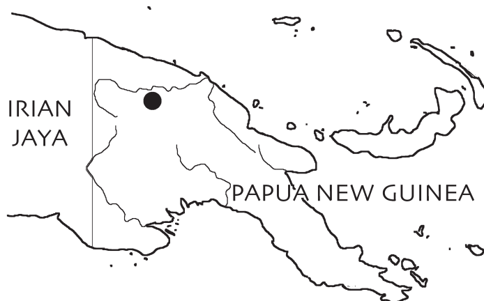
Fig. 2. Type locality (solid circle) of Bazzania scalaris .

Significant studies and reviews of the genus Bazzania have also been undertaken for South East Asia and Melanesia by Evans (1933), Grolle (1968, 1972), Herzog (1931, 1949, 1953), Kitagawa (1972, 1973, 1979, 1980), Meijer (1960) and Tixiér (1985), and for other nearby and distant regions of the world, e.g. Engel and Merrill (1994), Grolle and Schultze-Motel (1973), Hattori and Mizutani (1958), Jones (1975), Long and Grolle (1990), Mizutani (1967), Pócs (1969), Scott (1985).