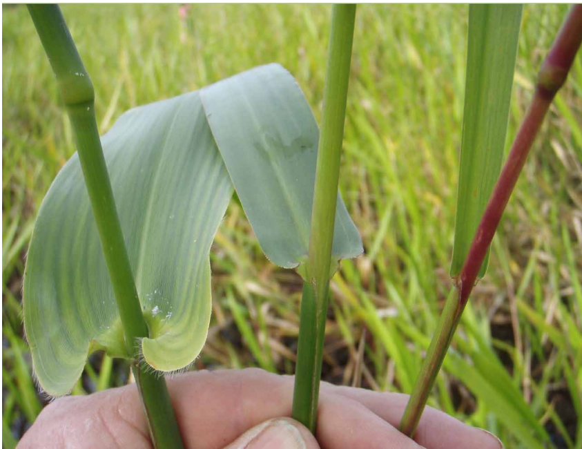
Fig. 1. Leaf blade bases of Hymenachne spp. Left to right: H. amplexicaulis (Clarkson 11787), H. × calamitosa (Clarkson 11789) and H. acutigluma (Clarkson 11788).

Nuclear ribosomal DNA internal transcribed spacer (ITS) regions were amplified using primers described in Sun et al. (1994) with PCR conditions as described by Torres González and Morton (2005). The region amplified included the 5.8S and part of the 18S and 26S rDNA. Amplified products were purified by column chromatography