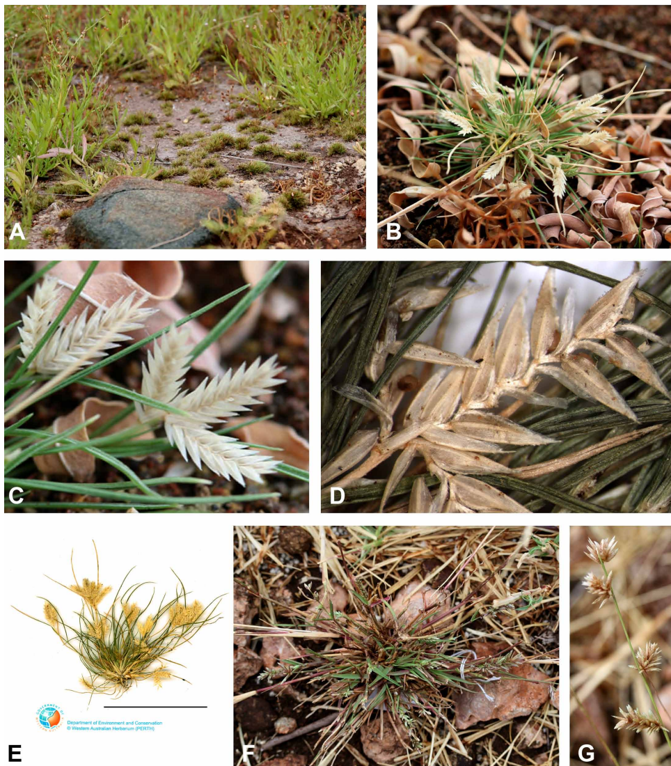
Fig. 1. Eragrostis surreyana . a , small tufted plants (in centre of the image); b , habit; c , & d , spikelets; e , scan of a specimen ( K.A. Shepherd et al. KS 1229, PERTH 08079439 ); Eragrostis cumingii . f , habit; g , inflorescence. Scale bar = 30 mm.