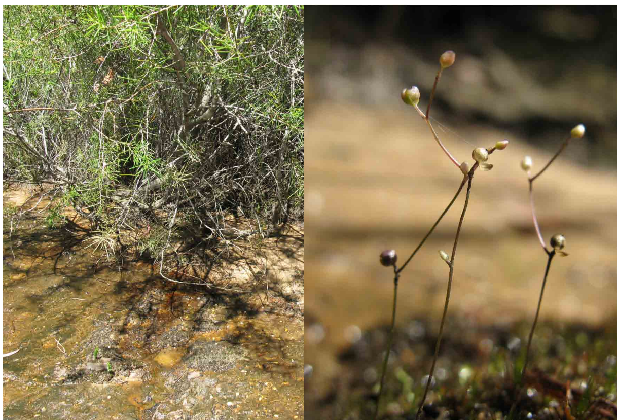
Fig. 2. Utricularia subulata . a , riparian habitat, Royal National Park, Sydney (Central Coast); b , 'zig-zag' habit of inflorescences (cleistogamous flowers).

Distribution : Pantropical: Australia, native to Queensland and Northern Territory; introduced in New South Wales, Central Coast, Royal National Park ( Ciric 4; Jobson 1355, 1409), and South Coast, Morton National Park, Porters Creek Dam, c.16 km W of Yatte Yattah ( Jobson 1359). The extent of the distribution and habitat preferences of this species are inadequately known, largely because only 19 other naturally occurring specimens are known from herbarium collections.