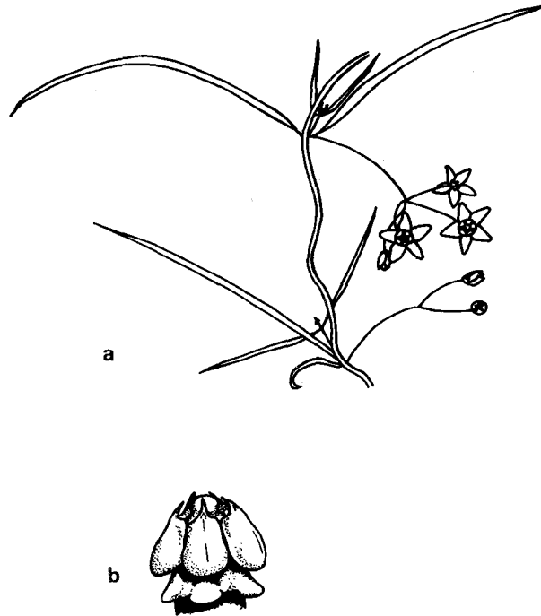
Fig. 2— Rhyncharrhena linearis (Decne.) K. L. Wilson. (a) Portion of a branch \times \frac{1}{3} ; (b) Corona \times c. 8; from McKee 8674.