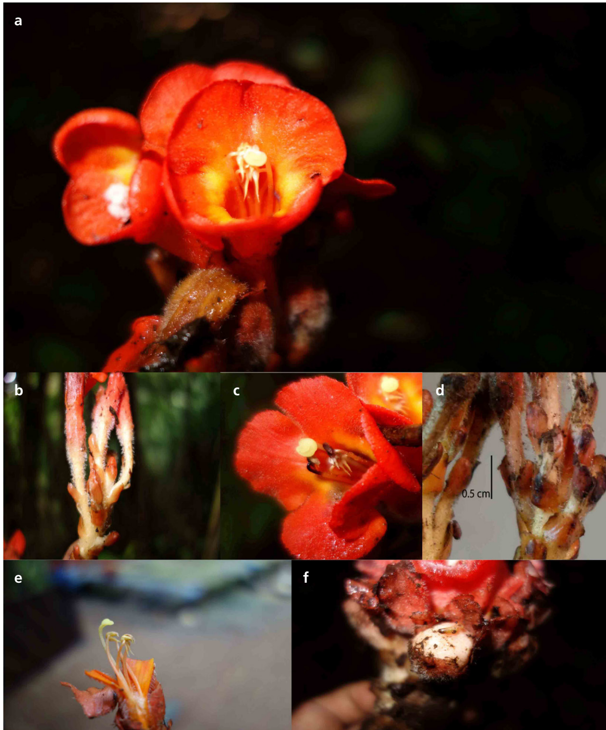
Fig. 4. Christisonia mira : a , opened flower; b , inflorescence; c , flower showing stamens and peltate stigma; d , flower bracts and bracteoles; e , Stamen with spurred anthers and stigma with depressed cavity; f , fruit. J. Mathew 3076 .