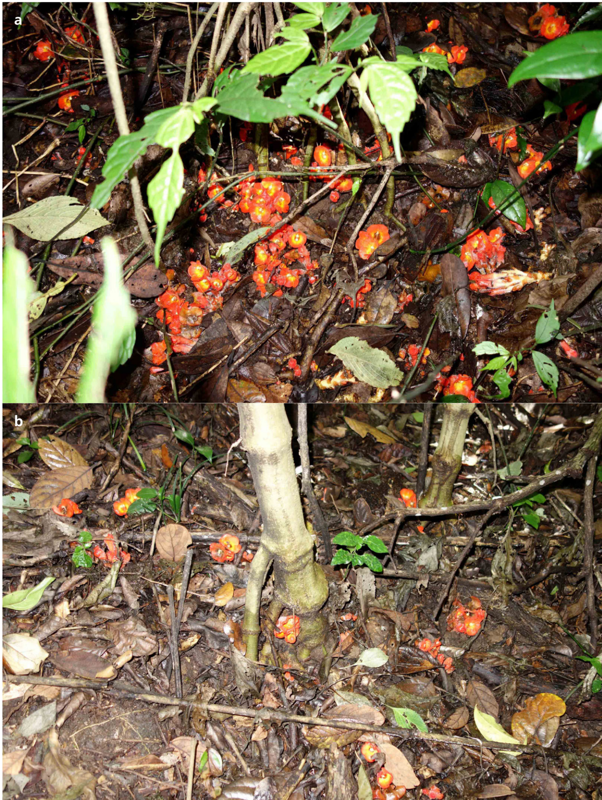
Fig. 2. Christisonia mira : a,b, plants in natural habitat. J. Mathew 3076 .