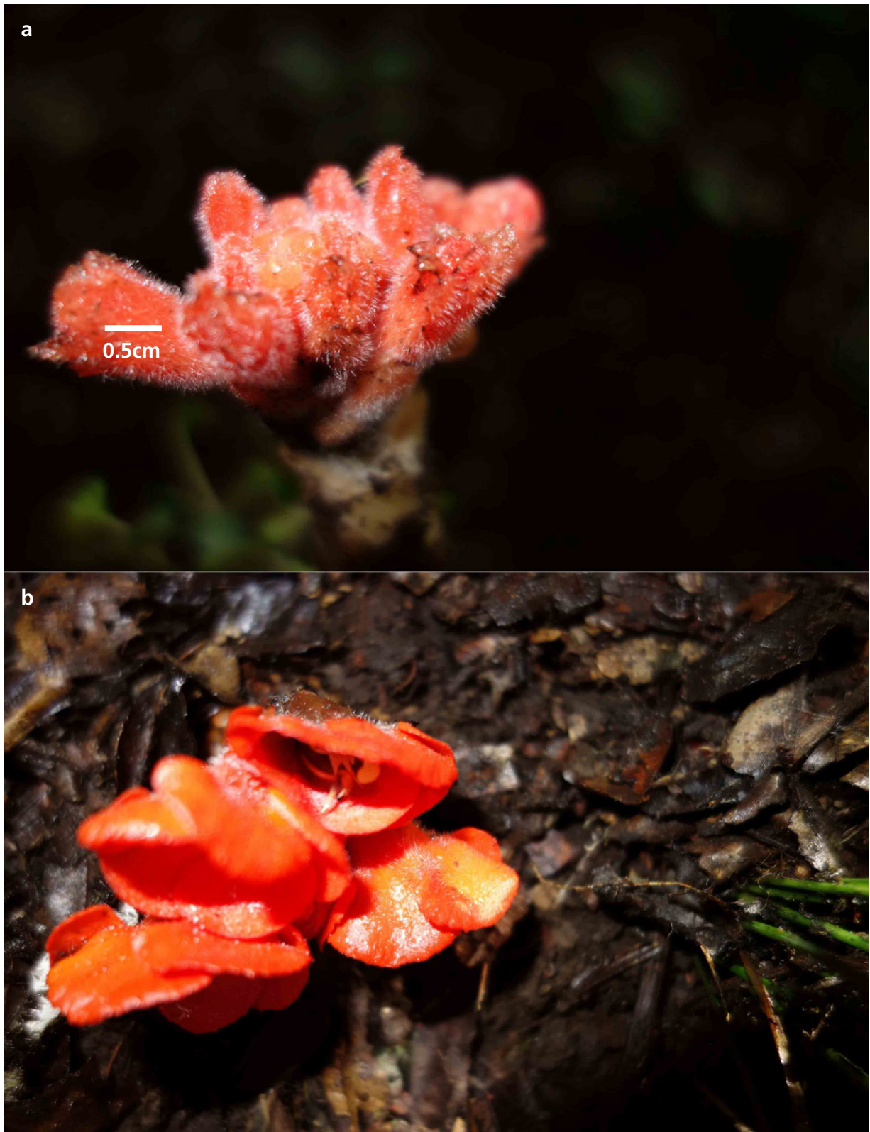
Fig. 3. Christisonia mira : a , unopened flowers with hairs; b , flowers. J. Mathew 3076 .