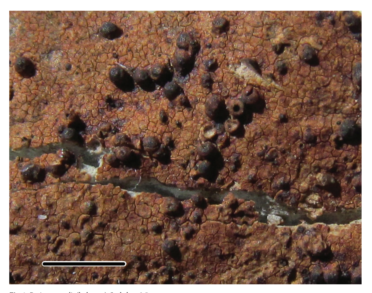
Fig. 1. Porina australis (holotype). Scale bar: 2.5 mm.

Manuscript received 2 September 2017, accepted 13 February 2017