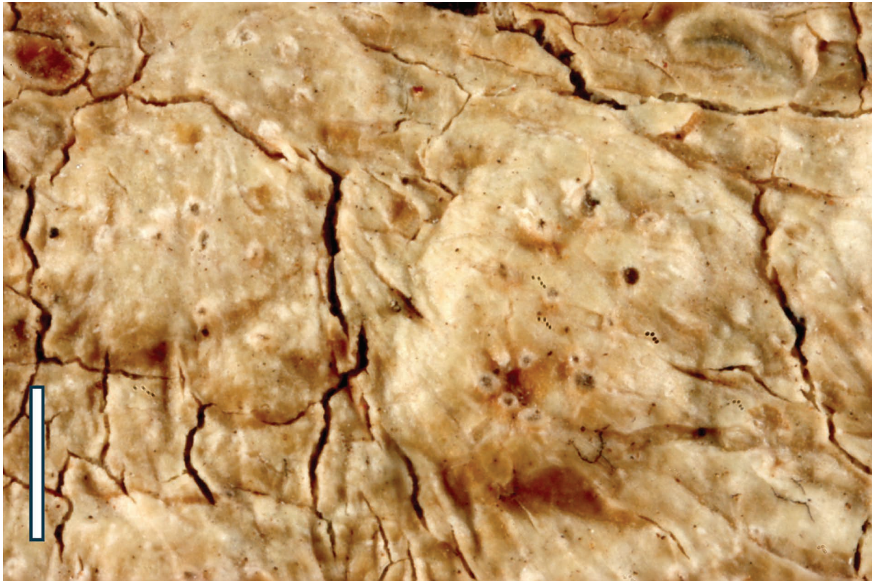
Fig.5 Pertusaria placocarpa ; holotype; bar = 1 mm

Chemistry: 4,5-dichlorolichexanthone (major-minor), planaic acid (major), 2- O -methylperlatolic acid (major to minor) and \pm 2'- O -methylperlatolic acid (trace).