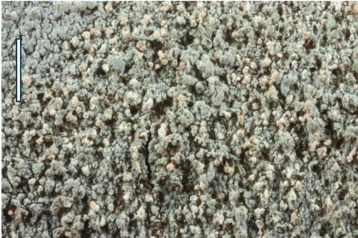
Fig. 7 Pertusaria scabrida ; holotype; bar = 1 mm

Chemistry: norstictic acid (major), connorstictic acid (minor-trace) ± sekikaic acid (major).