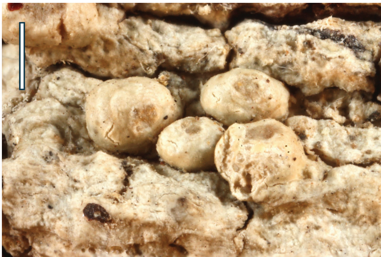
Fig. 2 Pertusaria dharugensis ; holotype; bar = 1 mm

Thallus corticolous, pale fawn, surface smooth and subnitid, lacking soredia and isidia. Apothecia verruciform, conspicuous, scattered, rarely confluent, hemispherical or flattened hemispherical, often constricted at the base, concolourous with the thallus, 1–1.5 mm diam. Ostioles inconspicuous, pale brown, translucent, 1 per verruca, 0.2–0.4 mm diam. Ascospores hyaline, ellipsoid, 8 per ascus, imbricate uniseriate, with smooth inner walls, 80–105 µm long and 32–37 µm wide. Fig. 2.