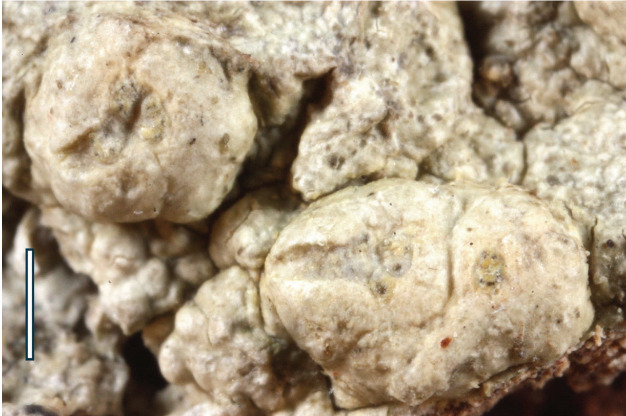
Fig.1 Pertusaria albula ; holotype; bar = 1 mm

Thallus corticolous, greyish white, fluorescing bright yellow under long wave-length ultraviolet light, surface smooth and shiny, slightly cracked, lacking soredia and isidia. Apothecia verruciform, conspicuous, scattered, rarely confluent, flattened hemispherical, not constricted at the base, concolorous with the thallus, 1–1.5 mm diam. Ostioles inconspicuous, pale brown, translucent, 1–2 per verruca, 0.1–0.15 mm diam. Ascospores 8 per ascus, colourless, ellipsoid, with smooth inner walls, uniseriate, 84–100 \mu\text{m} long and 40–48 \mu\text{m} wide. Fig. 1.