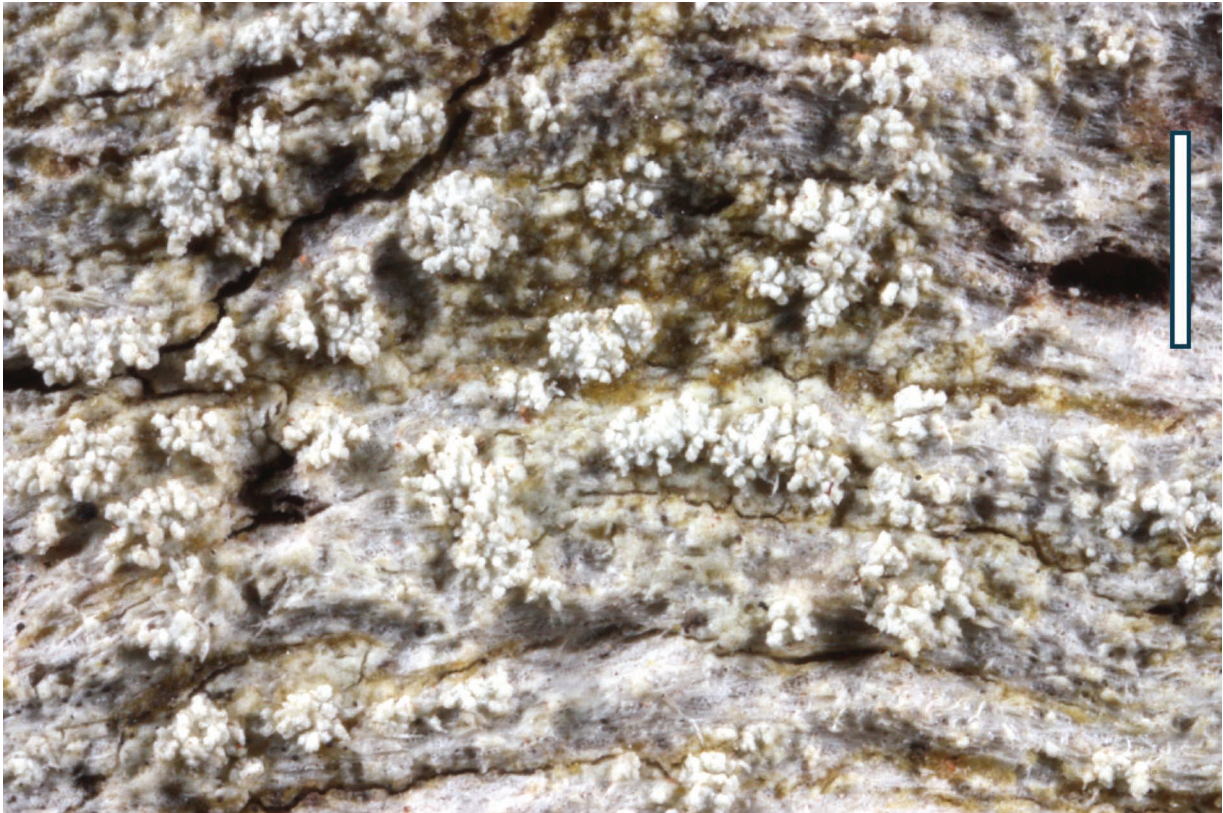
Fig.6 Pertusaria puttyensis ; holotype; bar = 1 mm

Thallus corticolous, pale olive-green, thin, surface smooth, sorediate, lacking isidia. Soredia occurring in well-defined soralia, the soralia inconspicuous, scattered, circular, oval or irregular in outline, 0.2–0.5 mm wide; apothecia and ascospores not seen. Fig. 6.