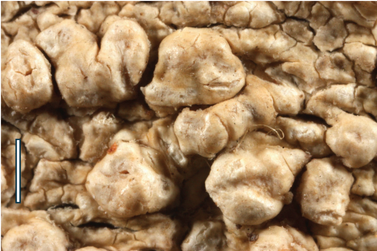
Fig.4 Pertusaria pinnaculata ; holotype; bar = 1 mm

Chemistry: lichexanthone (major) and 2,2'-di- O -methylstenosporic acid (major).